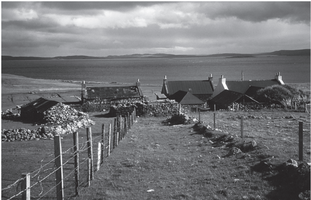
Fig. 2. Udal and crofting tenant holdings at Coppister, Yell, Shetland. The middle house, called the Auld Haa, belongs to a small udal holding that has never been part of a large estate. To the left is Lowerhouses and to the right Da Kitchen, former udal holdings that became tenanted crofts in 1882 when the land was bought by a Lerwick merchant. The holdings consist of intermixed parcels of land separated by stone walls and fences.

The Norse narrative includes excavated foundations of Viking longhouses, Norse fortresses and palaces, and the 12th-century St Magnus Cathedral in Kirkwall. At Tingwall, in Shetland, is an islet named the Law Ting Holm, reputed to be the open-air meeting-place of the medieval Shetland law court. This is an example of the manifestation of the law in the landscape both materially and immaterially through the surviving place-name. Landholdings showing continuity from Norse times are still thought of as “udal” holdings (Fig. 2). Jetties with houses built on the foreshore, although dating from the 18th century, are known as lodberries in Lerwick, from Old Norse hlaðberg , meaning loading rocks